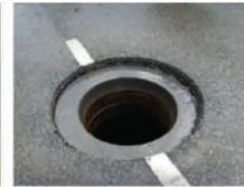
3. After Break & Repair