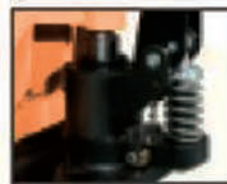
Super - heavy duty hydraulic pump

Bracket available with channel steel fork or 6mm thick steel Plate, Steering and fork wheels available super strength nylon or steel.